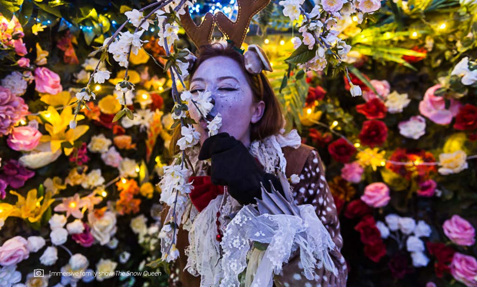
📷 Immersive family show The Snow Queen