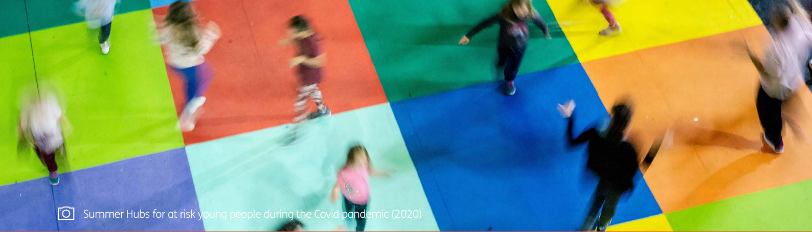
📷 Summer Hubs for at risk young people during the Covid pandemic (2020)

The creative passion, energy and commitment of Theatr Clwyd to engage and support children is refreshing and inspiring.