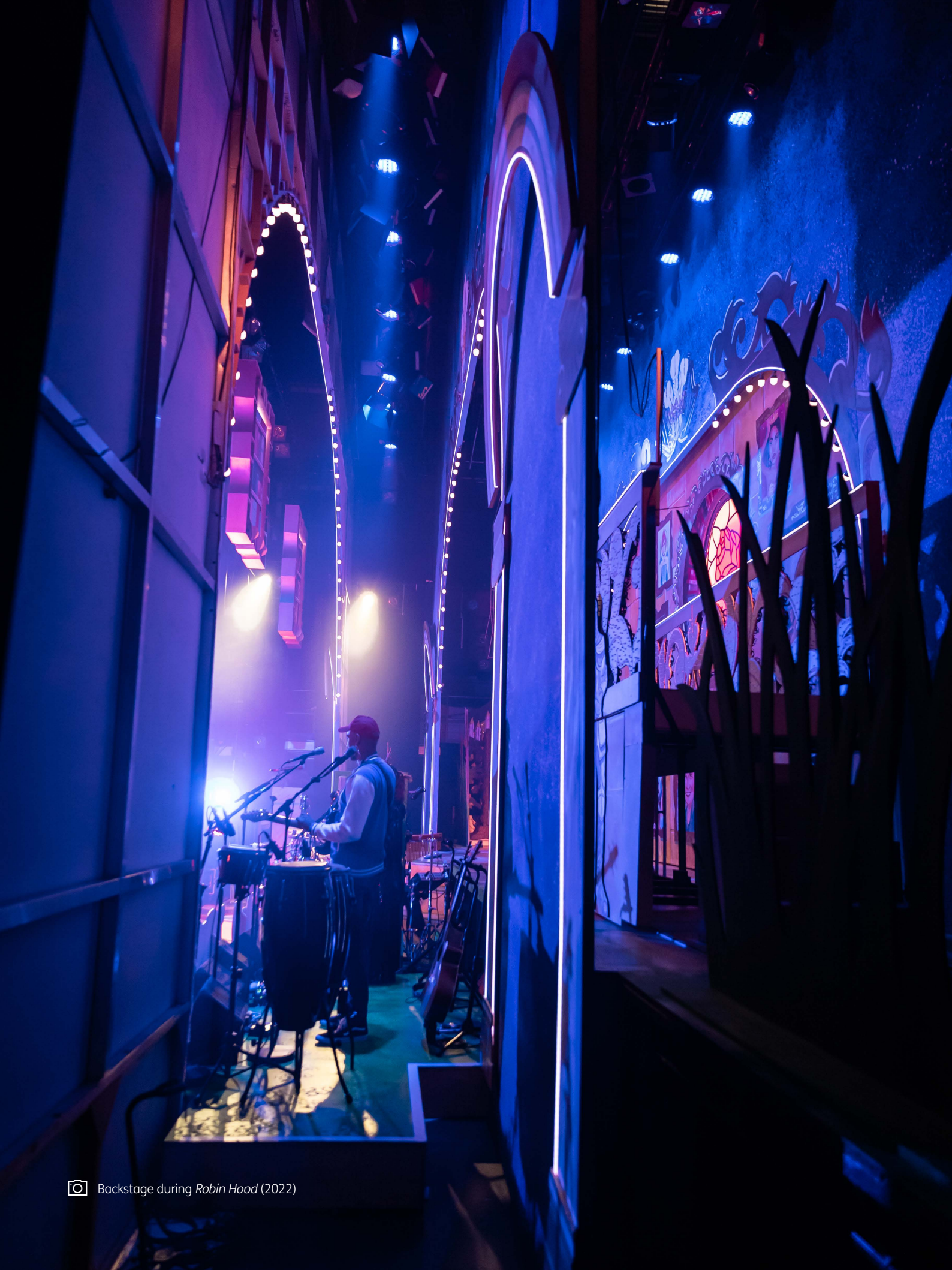
📷 Backstage during Robin Hood (2022)